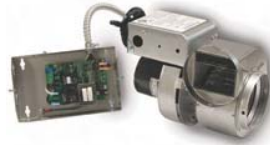
HSJ,1,2 Include UC1 Control

Used for side wall venting natural gas, LP or oil fired equipment including: furnaces, boilers, water heaters and unit heaters. All models feature the UC1 Universal Control and a diaphragm Fan Proving Switch safety interlock. Damper allows adjustment for maximum combustion efficiency. Inputs up to 600,000 BTU/hr.