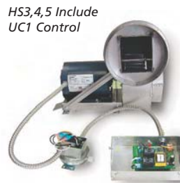
HS3,4,5 Include UC1 Control

Used for commercial applications to side wall or vertically vent natural gas or LP fired atmospheric or power burner equipment. All models feature the UC1 Universal Control and a diaphragm Fan Proving Switch safety interlock. Interlocks with any 24/115 VAC burner control circuit and also includes "dry" contact actuation option. Excellent for electric-to-gas conversions, renovations, new construction or for replacing deteriorated chimneys. Inputs from 450,000 to 1,825,000 BTU/hr.