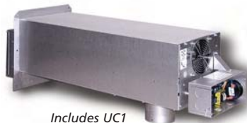
Includes UC1 Control

The most technologically advanced sidewall vent systems available. Includes the UC1 Universal Control. Designed for oil fired heating equipment or a deluxe gas vent system. Patented terminus prevents staining by propelling flue gases away from the building exterior. Features; zero clearance installation, pre-wired operation and safety controls and stainless steel construction in all critical components. The second generation SS2 features a self-cleaning blower wheel, ultra fine draft adjustment and slide out venter assembly.